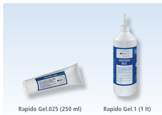
Rapido Gel.025 (250 ml)