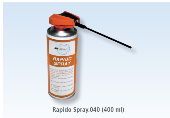
Rapido Spray.040 (400 ml)