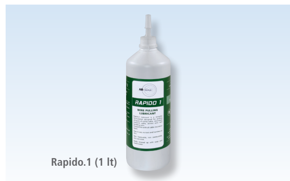
Rapido.1 (1 lt)